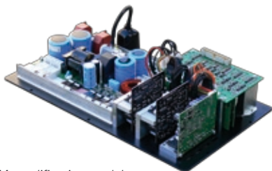
PWM amplification module

Both the S6X and the S7A Mk2 ADAM use the new generation of switching amps and power supplies. These are combined in an extremely powerful (1000 and 1500 W rms respectively) yet cool amplifier assembly. Together with the built in overload protection circuits these amplifiers will run reliably and at constant safe operating temperatures not possible with conventional designs. The amplifiers are of extremely low output impedance, leading to a damping factor >4.000, enabling them to strictly control the motion of the drive units.