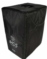
iCover Tilos L Cover for Tilos L