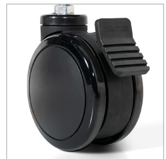
Non-marking locking / braked castors included