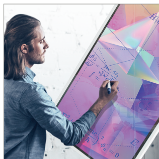
-4.5° negative tilt provides an ergonomic, natural writing surface (ideal for Samsung Flip)