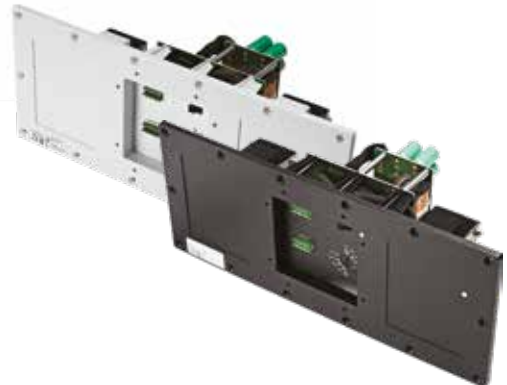
CROSSOVER INPUT PANELS