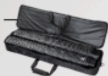
POLAR Column Carry Bag

This padded bag accommodates the Mid/High-Unit and the Spacer.