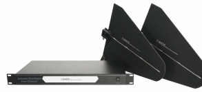
IWM Antenna Combiner

Wireless microphones 4 channel Antenna distributor