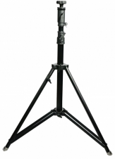
FOS Stand Led Follow Spot 350/600 Heavy Duty Black Stand for Led Follow Spot 350 and