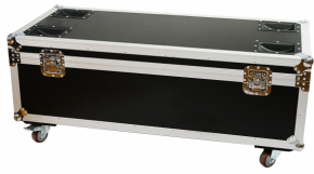
FOS Case Led Follow Spot 600

Flight case with wheels for Led Follow Spot 600.