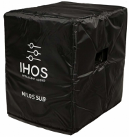
iCover Milos Sub Cover For Milos SUB