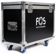
FOS Double Case Led Beam 150.

Double Case with Wheels for 2 pcs Led Beam 150.