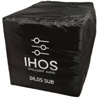
iCover Dilos Sub Cover For Dilos Sub.