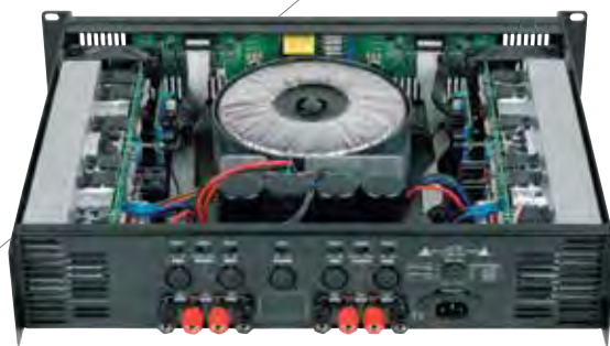
Internal view and rear panel.

In fact, it does what every other amplifier does, but twice better.