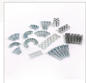
All fixings and mounting hardware included