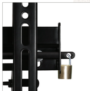
Locking bar for secure installation (padlock not included)