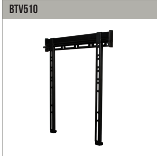
BTV510 Large Flat Screen Wall Mount for screens up to 55"