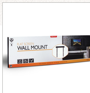
Supplied in retail packaging, ideal for the consumer market