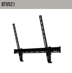
BTV521 Extra-Large Flat Screen Wall Mount with Tilt for screens up to 65"