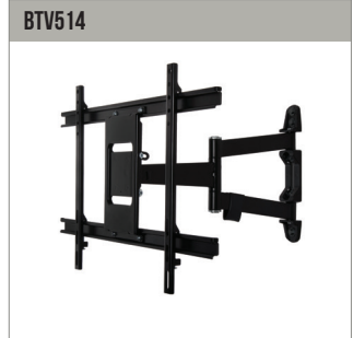
BTV514 Large Flat Screen Wall Mount with Double Arm for screens up to 65"