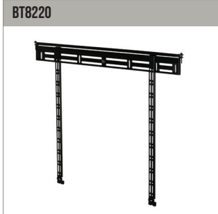
BT8220 Ultra-Slim Flat Screen Wall Mount for screens up to 80"