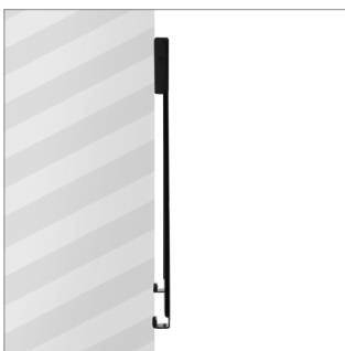
Low profile design mounts screen only 20mm from wall