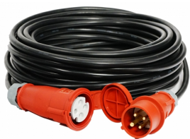
FOS V6 Motor Cable

25 meter cable with plugs for connecting controller