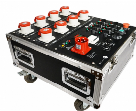
FOS V6 8way Controller

Flight case with wheels for 1 pc chain motor V6