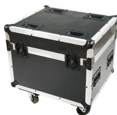
FOS V6 Case

10 meter cable with plugs for connecting controller