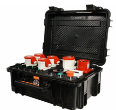
FOS V6 4way Controller

Portable electric motor 8 way controller, built in