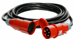
FOS V6 Controller Cable

25 meter cable with plugs for connecting controller